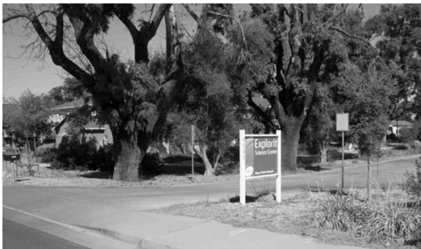
Entrance to Mace Ranch Park lot; 3141 Fifth Street

School visitors may park in the main lot of Mace Ranch Community Park, entrance at 3141 Fifth Street. (North side of Fifth Street). The driveway is marked by a blue and white “Explorit” science center sign and is lined by walnut and olive trees leading to what looks like a ranch house. This is a public lot. Follow the concrete walkway adjoining the baseball fields to the school campus.